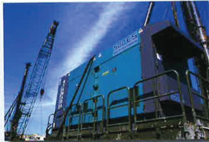
As the power source in the construction site.