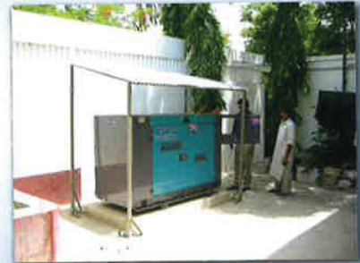
As the Emergency power source in the hospital.