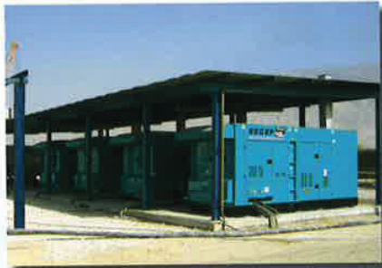
As the power source in the area where electricity is unavailable.